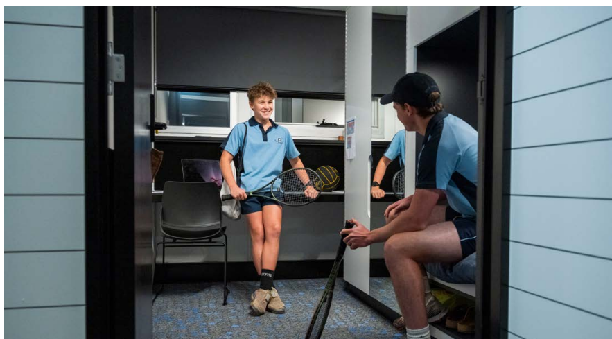
Harlin House (Years 9 to 12) ▲ Griffith House (Years 5 to 8) ▼

Harlin House is home to boys in Years 9 to 12. Individual rooms provide a space to recharge, while social areas foster connection.