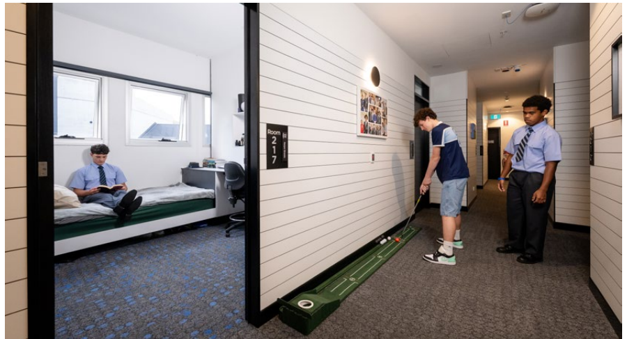
Harlin House (Years 9 to 12) ▲ Griffith House (Years 5 to 8) ▼

Harlin House is home to boys in Years 9 to 12. Individual rooms provide a space to recharge, while social areas foster connection.